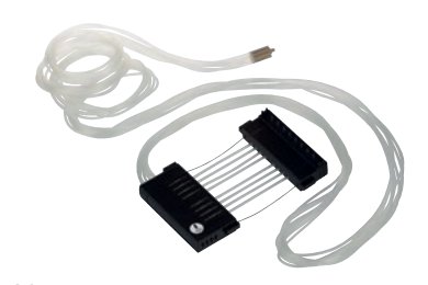
SMART+ long standard tube dispensing cassette