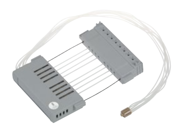
N22702 SMART+ small tube metal tip dispensing cassette