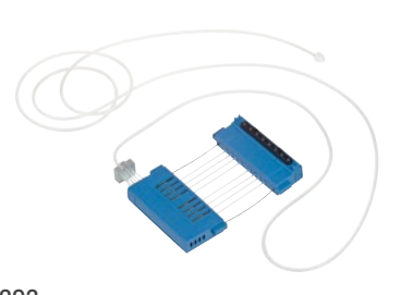
Long small tube plastic tip dispensing cassette